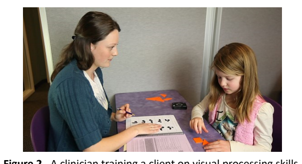
Figure 2. A clinician training a client on visual processing skills.